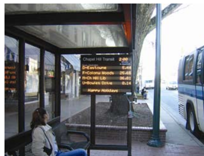
At Bus Stops

Your Riders Receive Real-Time Arrival Information Anywhere